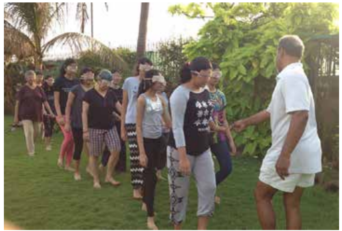
JB celebrates International Yoga Day